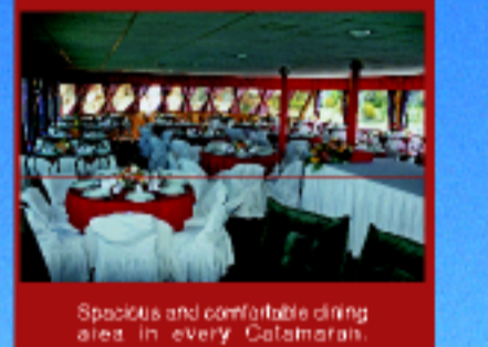
Spacious and comfortable dining area on every Catamaran

Includes a complete visit to the exclusive Inti Wata Cultural Complex at Sun Island