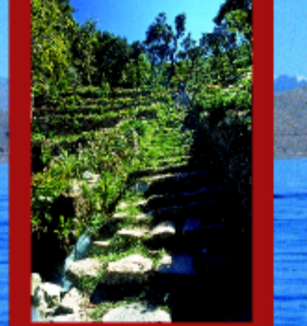
The Inca garden and Inca Statue looking to the Inca's Inca Fortress at the Inti Wata Complex is located just a few meters from Inca Inca ruins